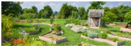
Raised beds in the Kentucky Children's Garden

Address The Arboretum, State Botanical Garden of Kentucky University of Kentucky 500 Alumni Drive, Lexington, KY 40503 Phone (859) 257-6955 Web http://arboretum.ca.uky.edu Facebook The Arboretum, State Botanical Garden of Kentucky Instagram @UKArboretum #ukarboretum