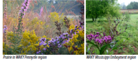
Prairie in WAKY Pennsylvia region